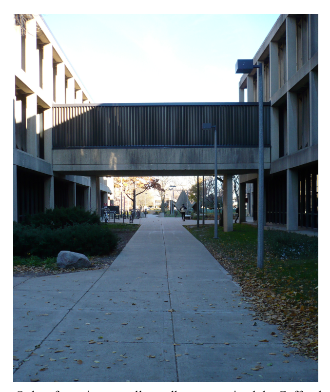
Only a few minor, smaller walkways survived the Coffey-led renovations.

the concrete and granite in the walkways and forum in good condition, but thought the calking to in need of repair. He charged that the renovations were "another example of Modern architecture at mid-century that is not yet properly recognized." <sup>108</sup>