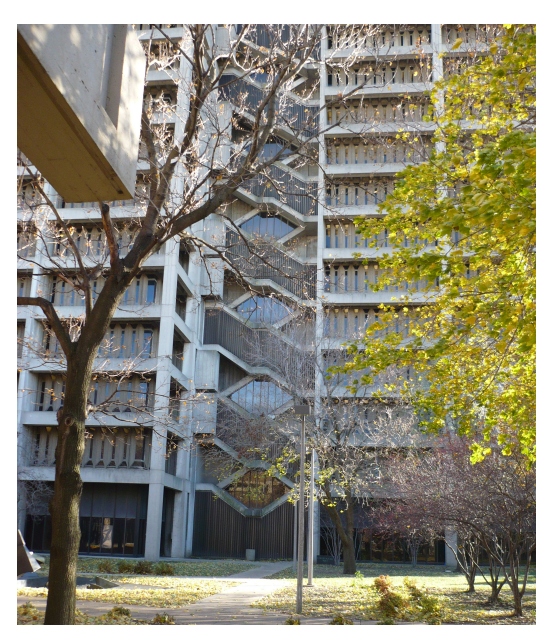
The Science and Engineering Offices Building features concrete scissor staircases.