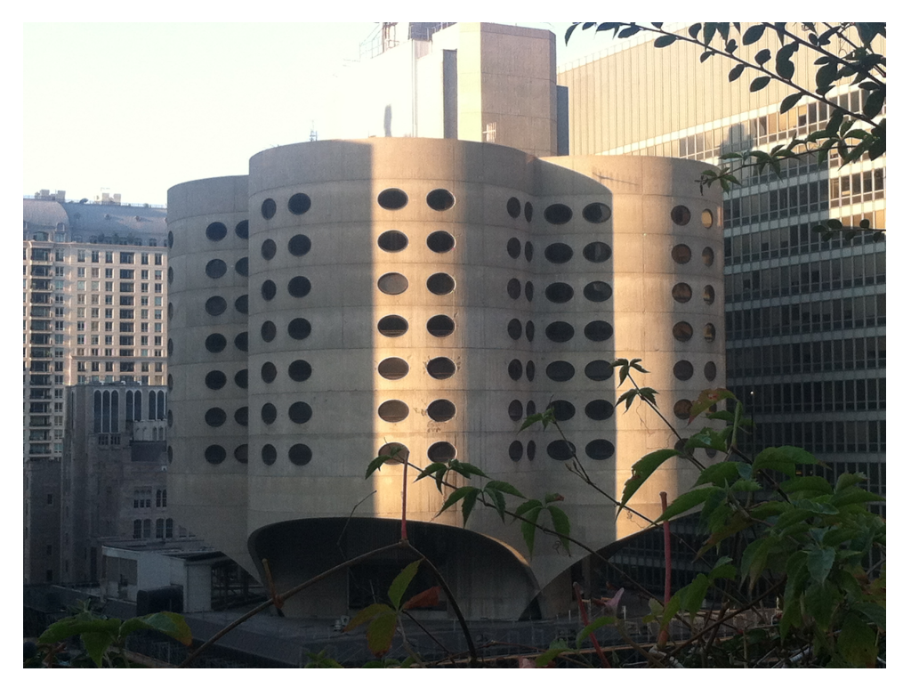
Preservationists argued Prentice's cantilevered shell was among the many features that spoke to its structural importance.

aesthetics but on the merits of originality and historic interest."<sup>253</sup> According to Hinkes-Jones, the fact that Prentice might have been considered "ugly" should be one of many considerations in discussing a building's merits.